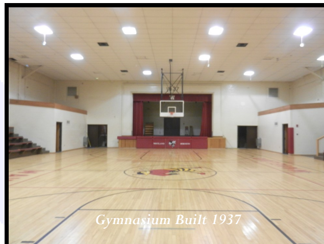
Gymnasium Built 1937