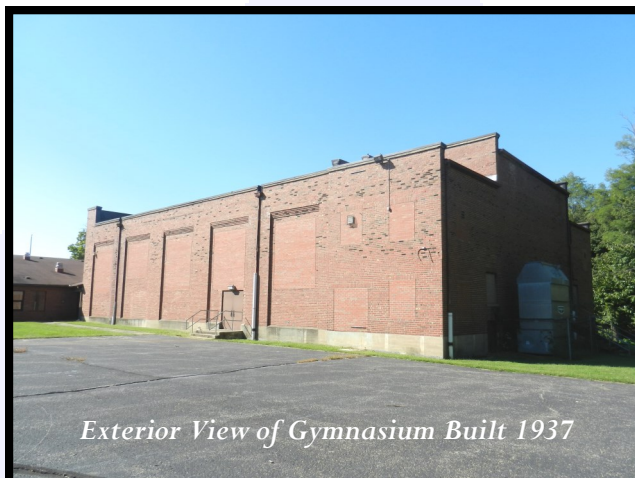
Exterior View of Gymnasium Built 1937