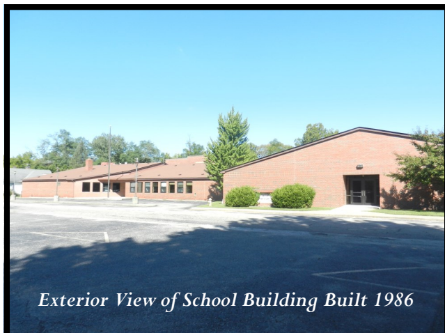
Exterior View of School Building Built 1986

Auction to be held on site at the subject property, 506 East Green Street, Waveland, IN 47989