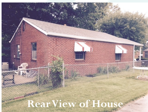
Rear View of House