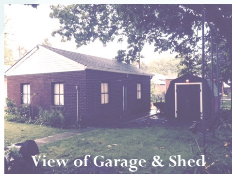
View of Garage & Shed

Directions to property & auction site: On the east central side of Indianapolis, take Emerson Ave. south from E. Washington St. to Brookville Rd. Go west to Worcester Ave. Go south to Stratford Ave. Go east to property.