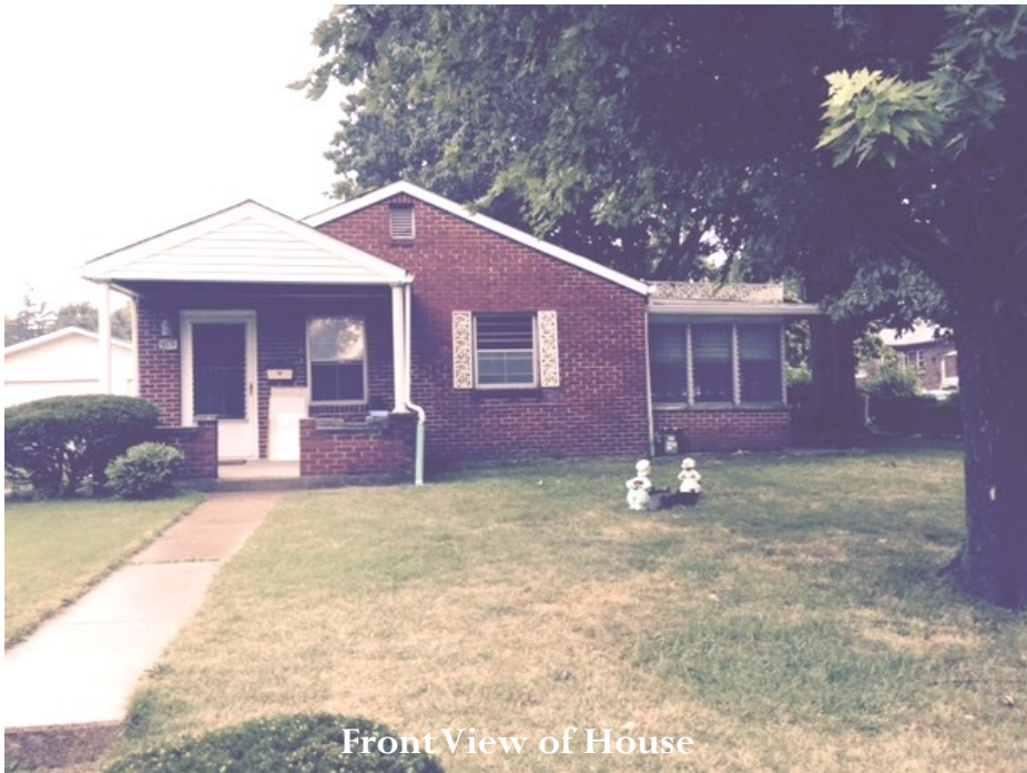
Front View of House

Auction to be held on site at the subject property, 4824 Stratford Avenue, Indianapolis, IN 46201